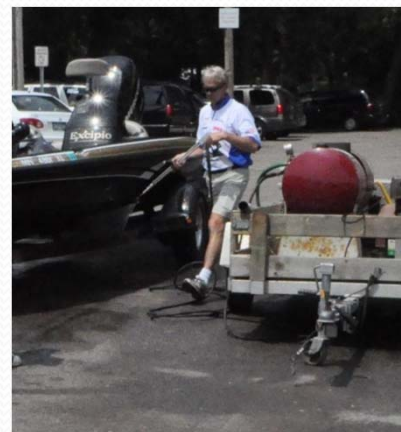
Boat Wash Station

The conservation aspect for the 2011 Junior TOC included a presentation on impacts and prevention of the spread of invasive species in our lakes and rivers. The invasive species focused on Eurasian milfoil, Zebra mussels and the spiny water flea. This included not only the education of the participants at the pre-event meeting, but also a session by the Minnesota DNR, and a “Boat Wash Station” for all participant boats to remove the threat of spreading any invasive species.